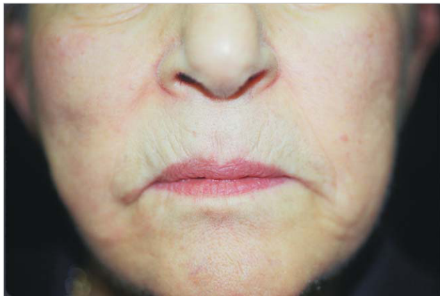
Figure 4. Gravity, maxillomandibular bony resorption, and further soft tissue volume loss at the oral commissures cause the commissures to turn downward in a perpetual frown.