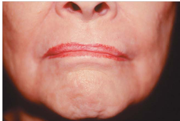
Figure 5. Vertical geniomandibular (“marionette”) lines extend downward from the oral commissures. Both hard and soft tissue volume loss cause the lip margin to become blunted with flattening of the philtrum columns and loss of projection of the cupid’s bow.

Santa Barbara, CA); and the Juvéderm (Allergan) family of products. Semipermanent fillers are stimulatory in nature and include calcium hydroxylapatite (Radiesse; BioForm, San Mateo, CA) and poly-L-lactic acid (Sculptra; Sanofi Aventis, Bridgewater, NJ). Stimulatory fillers stimulate or induce new collagen formation. Radiesse is a biphasic bioactivator; the calcium hydroxylapatite microspheres (the stimulatory component) are suspended in a carboxymethylcellulose gel. The latter gives immediate volume correction, but is more rapidly metabolized. The calcium hydroxylapatite microspheres remain after the gel is metabolized and become surrounded by new collagen bundles; these are the “stimulatory” component of the product. Sculptra is a monophasic stimulatory filler; it gives no immediate volume enhancement, but promotes neocollagenesis and dermal thickening over time. Sculptra requires several treatments to obtain the desired clinical result. The stimulatory fillers are more robust, generally require deeper placement, and seem to have a higher incidence of nodules when placed in the lips. Therefore, they are not recommended for lip augmentation.