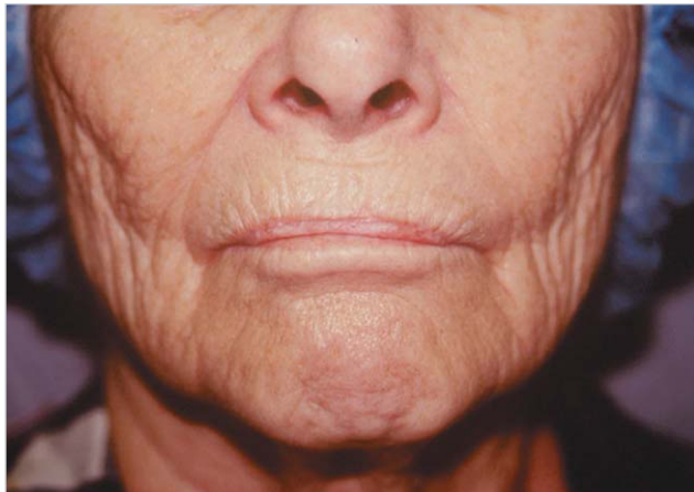
Figure 3. Angular, radial, and vertical “lipstick bleed lines” are often the result of genetics, intrinsic aging, sun exposure, smoking, and repetitive pursing of the orbicularis oris muscle.

plements and other preparations not approved by the US Food and Drug Administration (FDA).