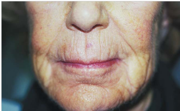
Figure 2. Thinning and loss of vermilion volume and lengthening of the cutaneous portion of the upper lip with age.