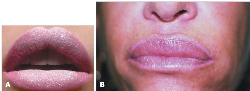
Figure 6. A. “Sausage” or “duck” lips occur from overcorrection, but also from a poor understanding of the delicate contours of lip anatomy. B. Avoid obliteration of the cupid’s bow and creation of the “sausage” or “duck” lip.

The earliest fillers approved by the FDA were derived from bovine collagen. Zyderm and Zyplast were introduced to the cosmetic surgery market in the early 1980s and became the standard against which all other injectable fillers were measured. 6 Because these products are derived from bovine collagen, they require a skin test to determine allergic cross-reactivity; this necessitates a wait of at least 4 weeks before lip implantation. Human-derived collagen, obtained from neonatal foreskin (Cosmoderm and Cosmoplast) was developed and approved by the FDA in 2003. The advantages of these