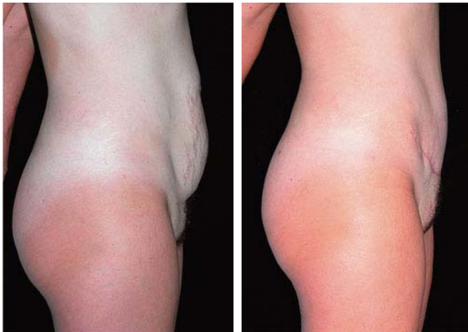
42 Year Old Woman after 3 Children. Before and Six Months after Ipanema Tummy Tuck.

Compared to traditional liposuction or the more aggressive power-assisted liposuction, laser-assisted liposuction is less traumatic. The laser energy of Smartlipo “melts” the fat, converts it into a liquefied state and requires much less suction to remove the liquefied fat. In addition, the laser energy coagulates small blood vessels leading to less bleeding during the procedure and less bruising afterwards. The laser energy also stimulates new collagen production and has a tightening effect on the